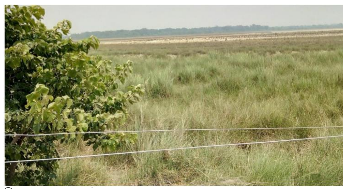
◆ ↑A wire fence barring entry at BNP at Ward No 4 of Geruwa Rural Municipality, including the area where people lost their land to the national park after the Geruwa river changed course

natural resources, or to "occupy, clear, reclaim or cultivate any part or grow or harvest any crop". <sup>79</sup> During the field research, a wire fence was observed, barring entry to the national park area, including the area from where the people had been displaced after repeated flooding. There were also several CCTV cameras installed along the park boundary fence. <sup>80</sup>